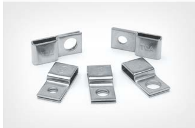
Stainless Steel P-Mount SSPC for use in arduous environments.