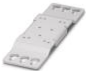
Universal wall adapter for securely mounting the power supply in the event of strong vibrations. The power supply is screwed directly onto the mounting surface. The universal wall adapter is attached at the top/bottom.

Assembly adapters - UWA 182/52 - 2938235