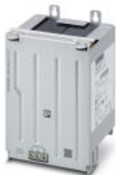
Energy storage device, LI-ION technology, 24 V DC, 120 Wh, for ambient temperatures of -20°C ... 60°C, automatic detection and communication with QUINT UPS-IQ

Please be informed that the data shown in this PDF Document is generated from our Online Catalog. Please find the complete data in the user's documentation. Our General Terms of Use for Downloads are valid ( http://phoenixcontact.com/download )